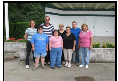
Our Dow Corning crew. This crew does cleaning and cage washing.