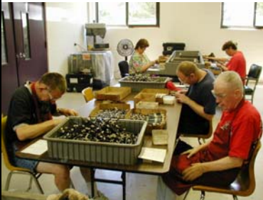
Sorting and refurbishing anti-rotation pins for Nexteer Automotive.

For more information about our production services call (989) 631-9570 or visit our website at www.arnoldcenter.org .