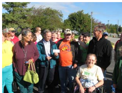
Arnold Center customers joined by staff are receiving the donation check from the club.